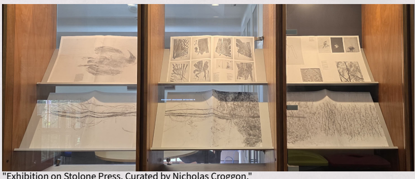
Exhibition on Stolone Press, Curated by Nicholas Croggon.'